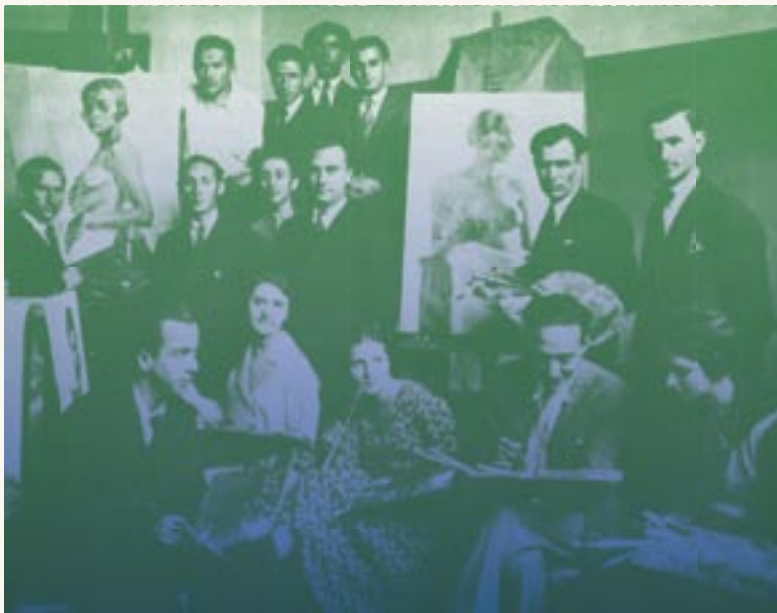
Left: Group of students at the ASFA (1932)