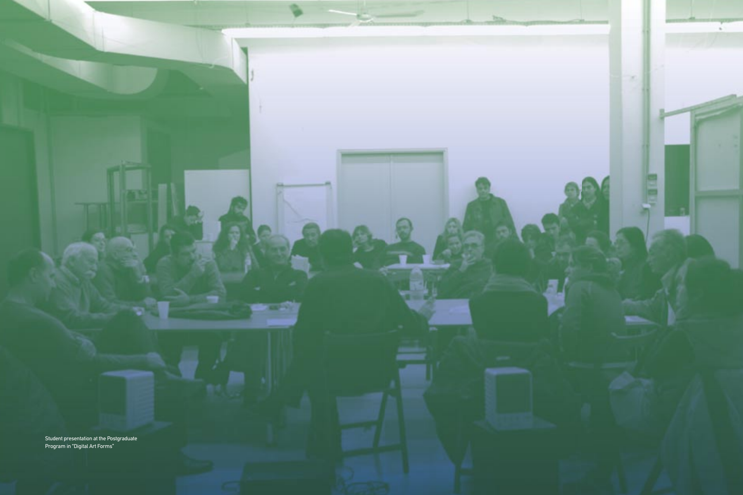
Student presentation at the Postgraduate Program in "Digital Art Forms"