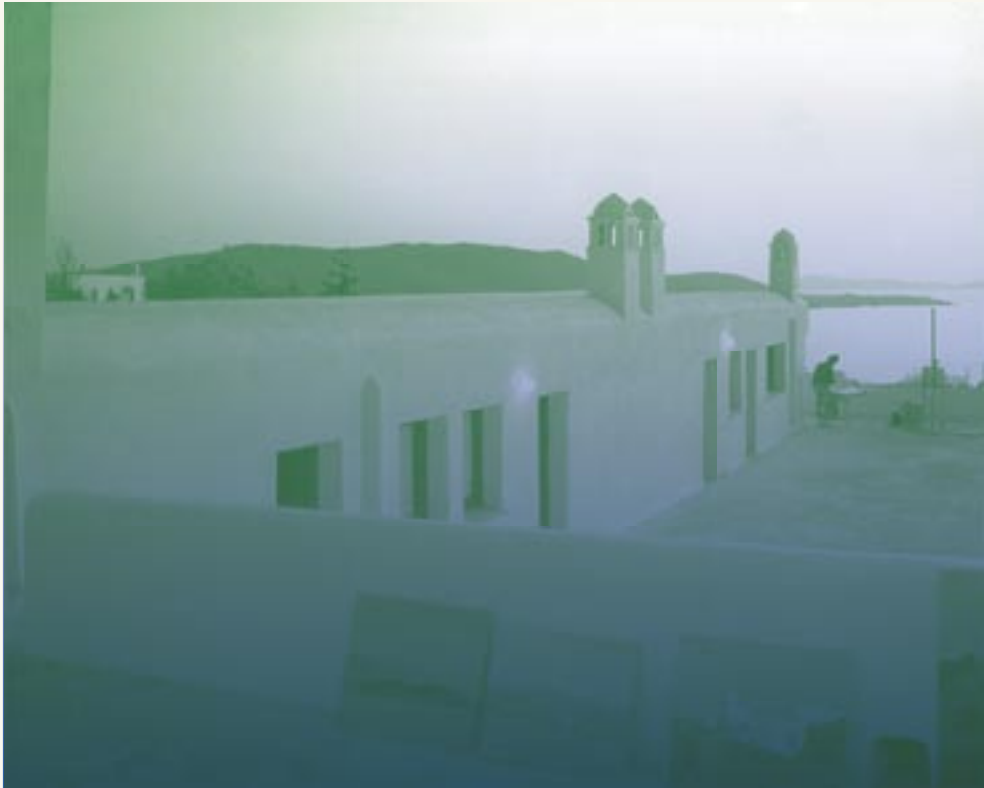
The ASFA annexes on Mykonos (left) and Hydra (right)