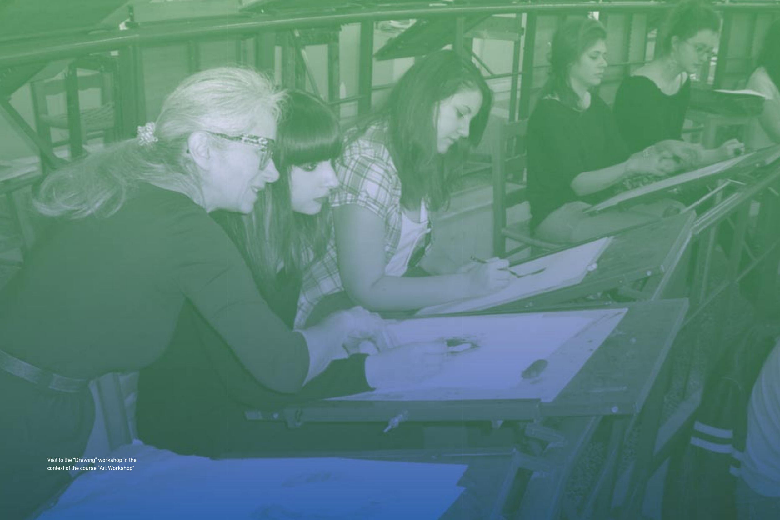
Visit to the "Drawing" workshop in the context of the course "Art Workshop"