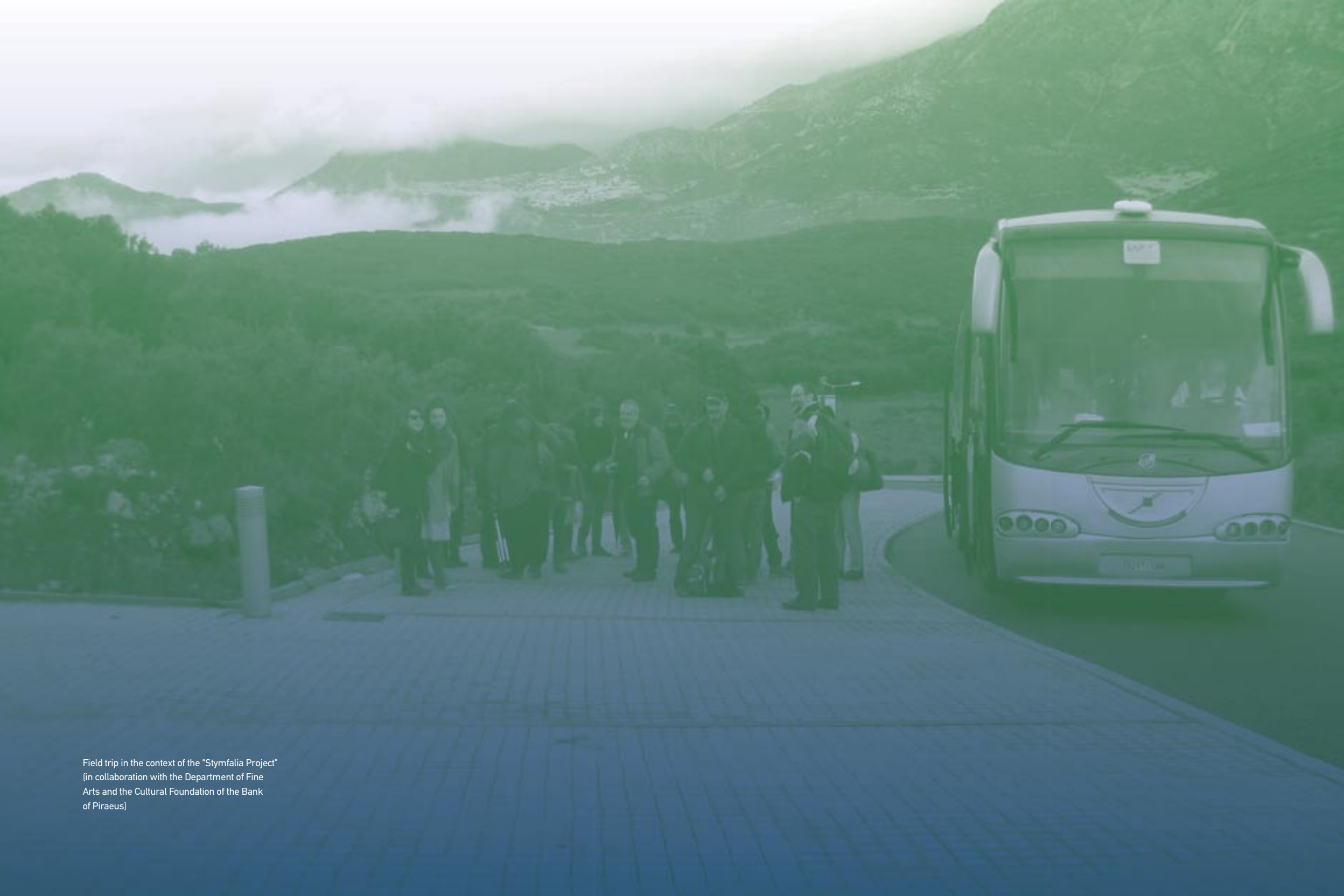
Field trip in the context of the "Stymfalia Project" (in collaboration with the Department of Fine Arts and the Cultural Foundation of the Bank of Piraeus)