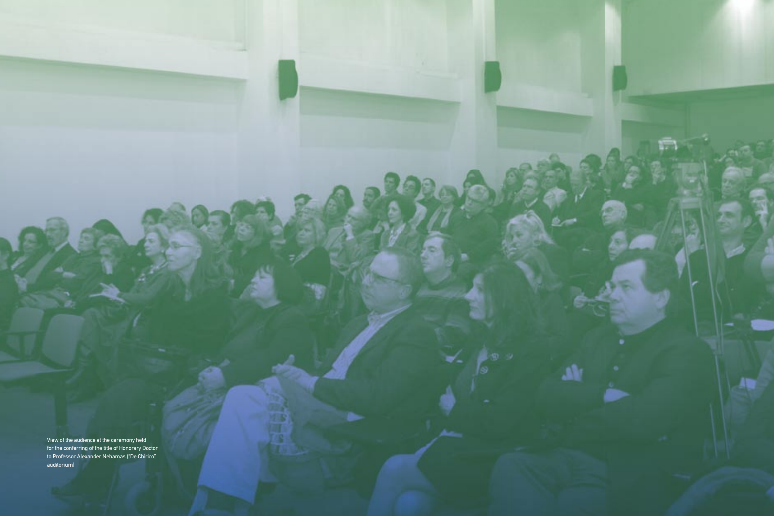
View of the audience at the ceremony held for the conferring of the title of Honorary Doctor to Professor Alexander Nehamas ("De Chirico" auditorium)