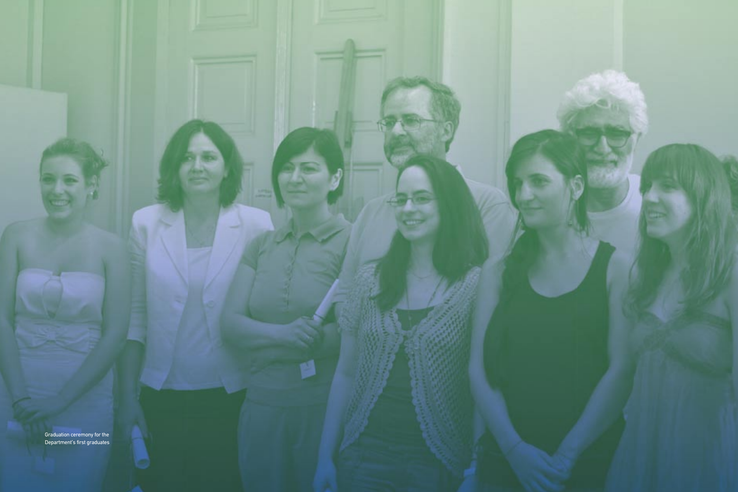
Graduation ceremony for the Department's first graduates